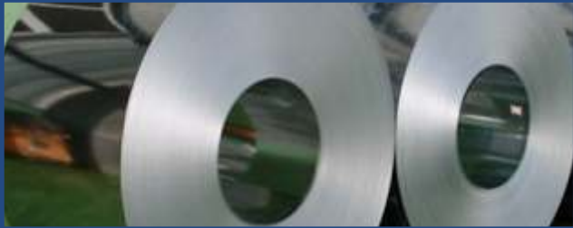
PLATES & COILS