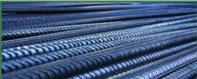
TMT / TOR

Following sizes are available in Reinforcement bars: Diameter (in mm): 8, 10, 12, 16, 18, 20, 25, 28, 32, 40, 45.